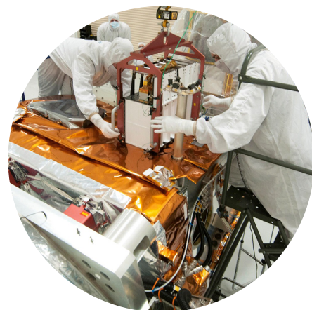
Images (Top): JPSS-1 at VAFB; (Bottom): OMPS instrument integration.