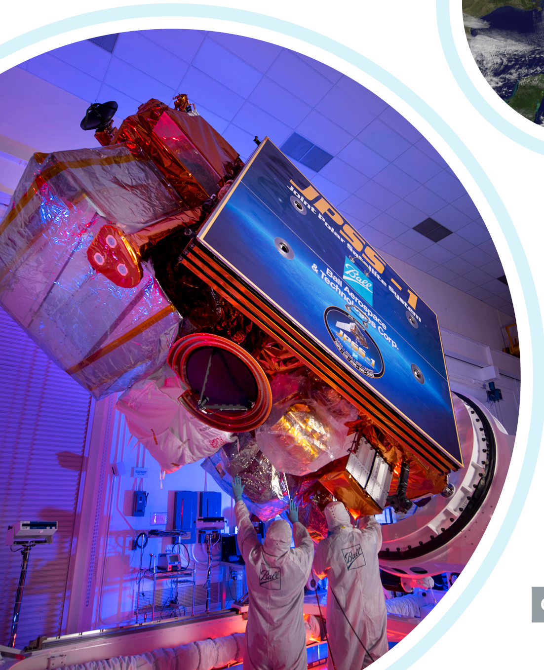
Images (Left): Preparing JPSS-1 for VAFB; (Above) Atlantic hurricane as imaged by VIIRS.